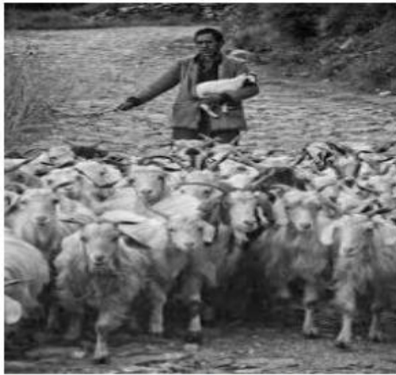
Gaddi shepherds of Himachal Pradesh