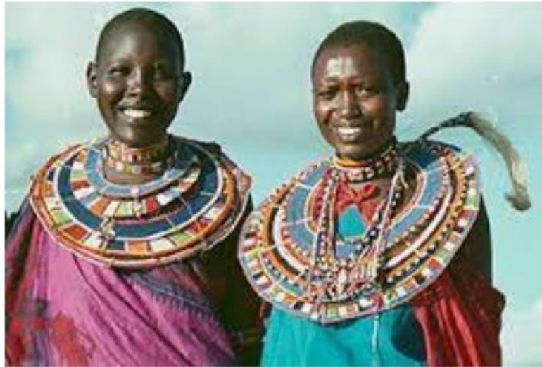
Women of the Maasai community of Kenya