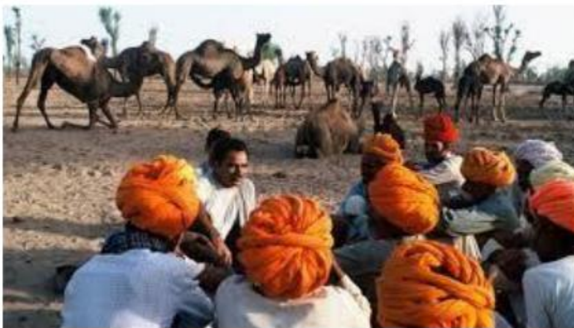
Raikas mainly live in the deserts of Rajasthan

move through different terrains and they establish relations with the farmers while moving. They also combine a range of various activities such as trade, herding and cultivation to make a living.